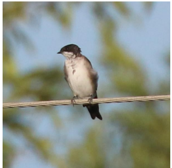
Progresso Lakes, TX

“The photos match up well with the migratory P.c. patagonica subspecies from southern South America, a subspecies a few folks have been expecting to make an appearance in the ABA region. The ABA Checklist Committee will now consider this same record for addition to the official ABA checklist.”