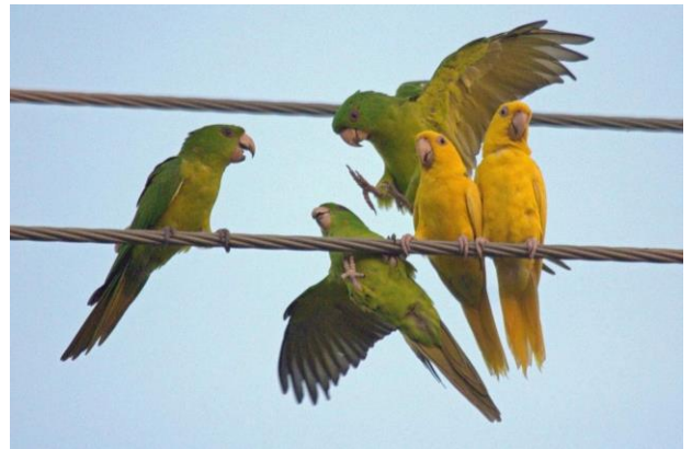
Photo at right, by Charles Alexander: Green Parakeets , Psittacara holochlorus

Each month, the Zoom lobby opens at 6:45pm for check-in, and the meetings begin at 7:00.